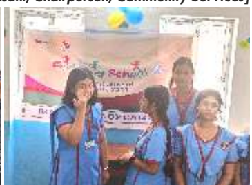
Health Clinc at Gothals Memorial Health Centre AOS: Community; AOF: Fighting Disease